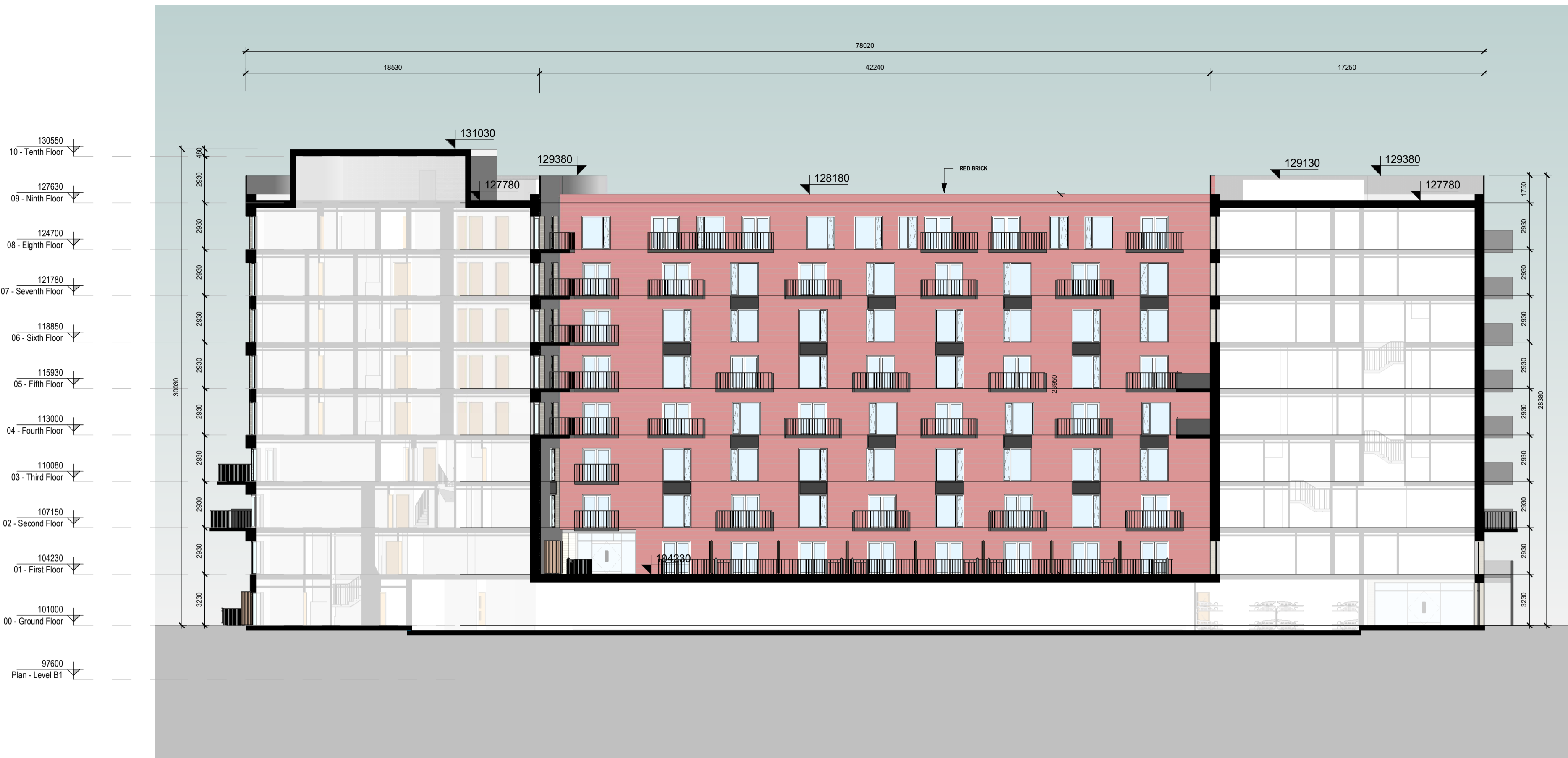
1 Block A - Elevation A5