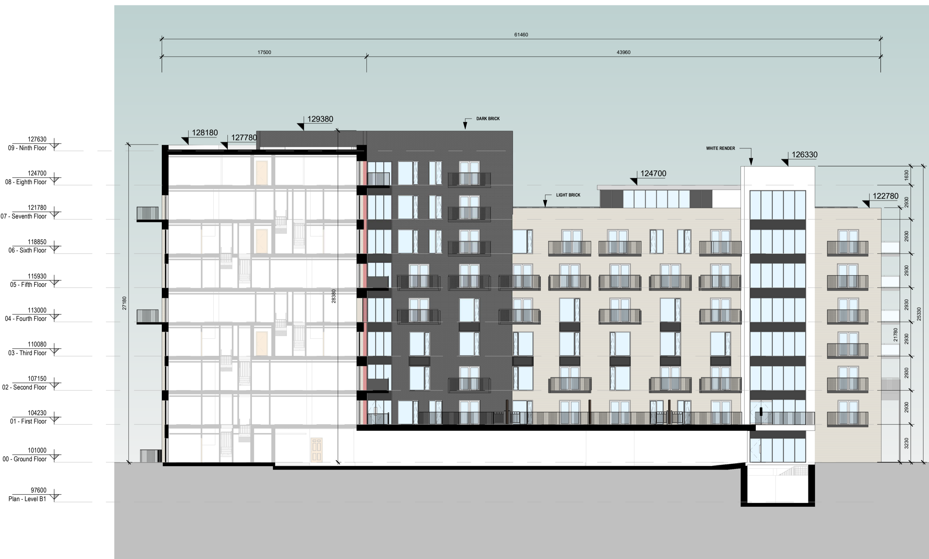
2 Block A - Elevation A6

1 Sarsfield Quay, Arbour Hill, Dublin 7 t: 01 518 0170 e: admin@cwoarchitects.ie Dublin | London | Warwick | Manchester www.cwoarchitects.ie